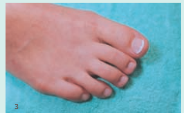
3 Your nail is finished and has a permanent French look.