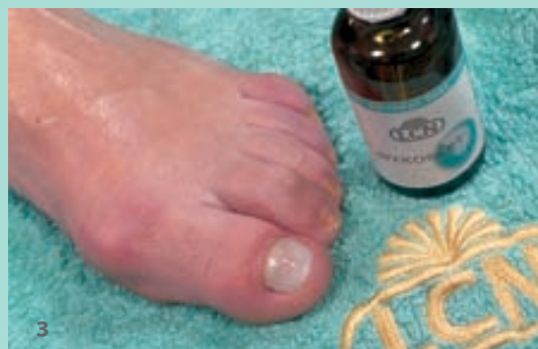
3 Your nail is finished with a subtle surface shine.