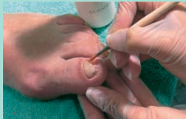
2 The nail is now modeled with WILDE-PEDIQUE plus and the shape determined. The material is cured in a special light unit for two minutes. The light is not dangerous and doesn't cause any changes of the skin.