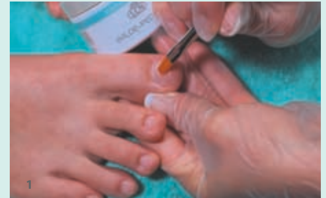
1 One layer of WILDE-PEDIQUE plus is applied onto the natural nail.