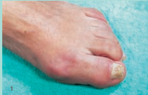
1 The nail before the treatment.